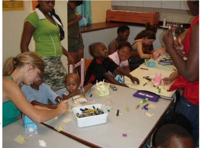
Colouring-in with the Hudson Park grade 7's